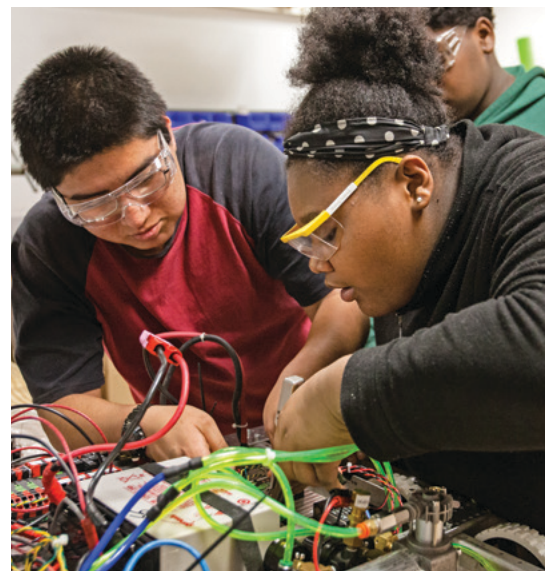
Students work on a robot at Ypsilanti STEMM Middle College, in Ypsilanti, Michigan.